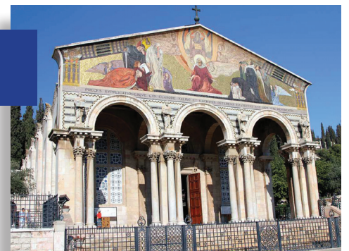
Church of All Nations